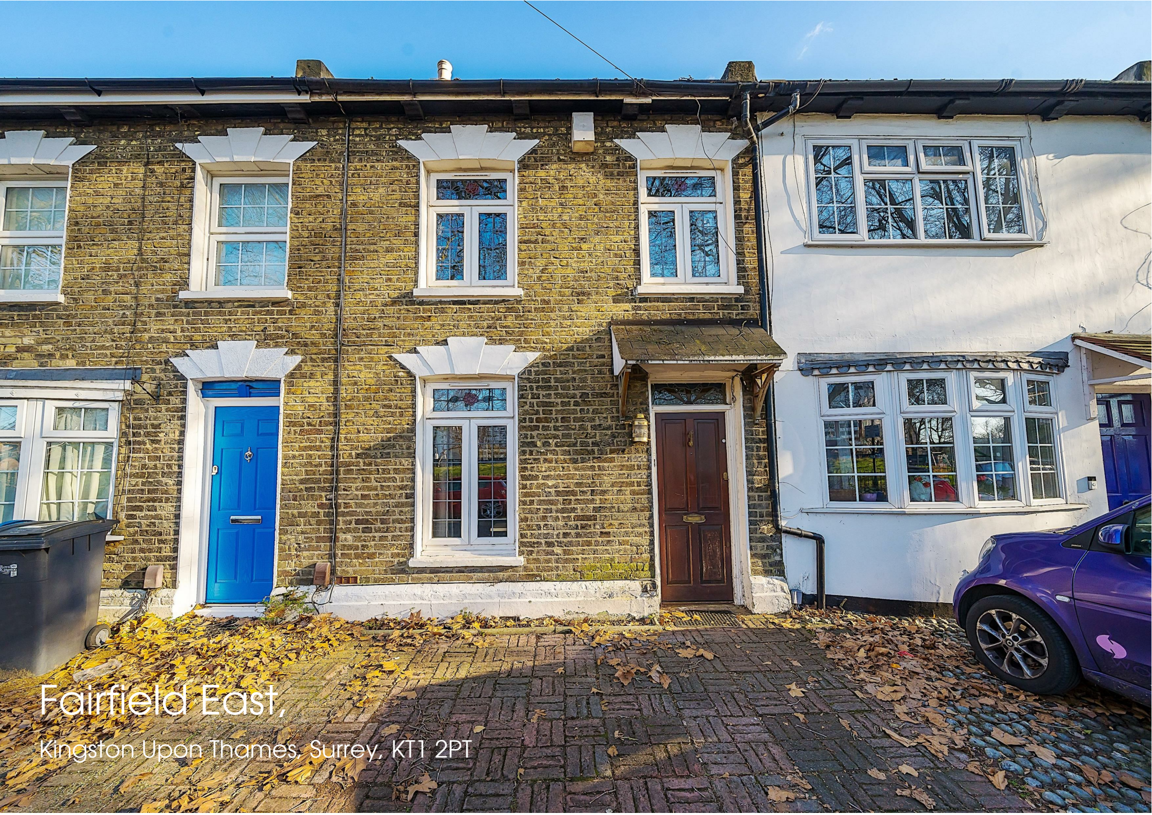
Fairfield East, Kingston Upon Thames, Surrey, KT1 2PT